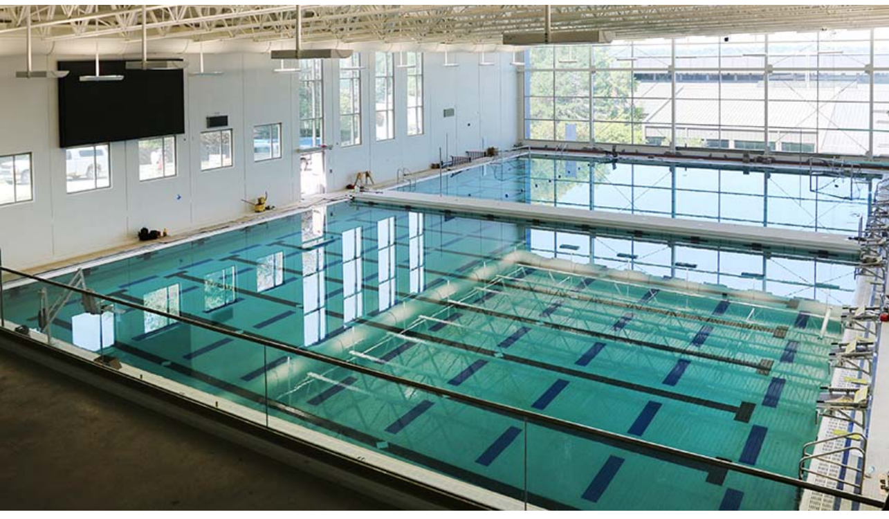
The finishing touches are being done on the new pool, slated to open next month.