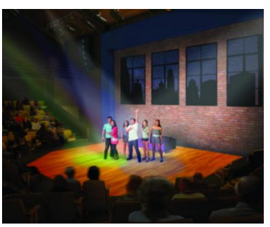
Visitors: Page 31