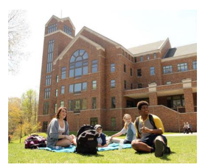
Students: Pages 3 – 20