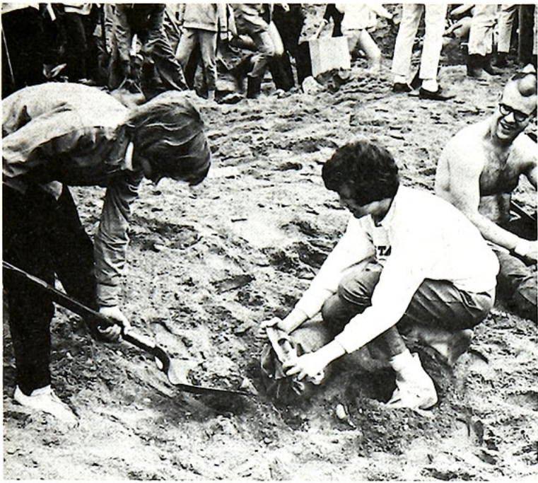
TWO AUGIE COEDS fill sandbag as a male volunteer looks on in amazement at their efforts. Coeds worked along with the men in the flood effort.