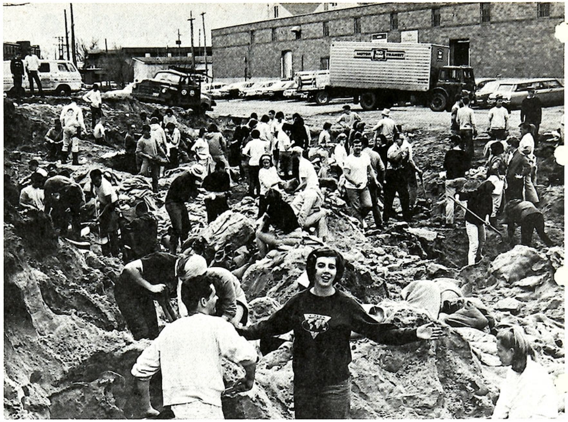
AT THE SANDPITS —This is part of the large Augie group that worked at the sandpits at 4th Ave. and 1st St., Rock Island. Augustana students gained nation-wide acclaim for their efforts in the battle against the worst flood in Quad-City history.