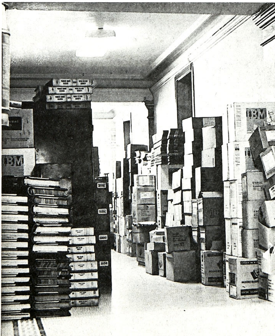
READY TO MOVE —Official documents and other material are shown stacked up at the Rock Island County Court House, where it was being kept in the event of emergency evacuation. The ground around the Centennial Bridge approach across from the court house was getting spongy with the seepage through an Augustana-built dike under the bridge.