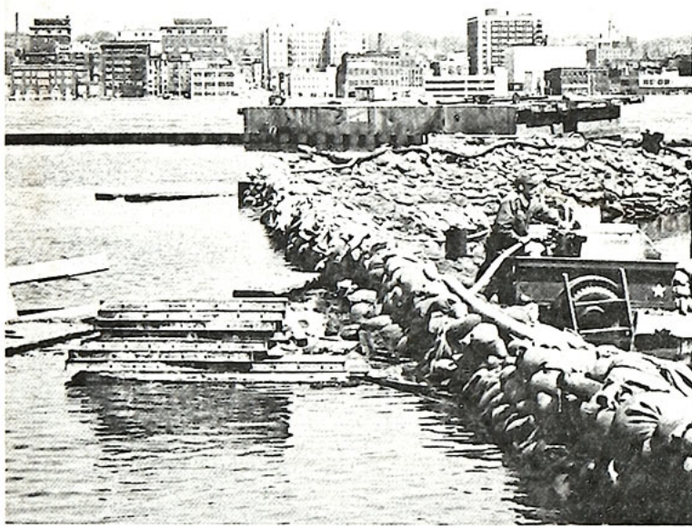
AT THE ARMORY —A secondary dike holds water which had gone past the Rock Island seawall near the Armory. A number of the Illinois National Guard pumps water which had seeped into the lower area back into the inundated city parking lot.