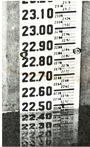
CREST: 22.48 —The official corps of engineers depth gauge on the arsenal island shows the crest Wednesday afternoon at 22.48 feet.